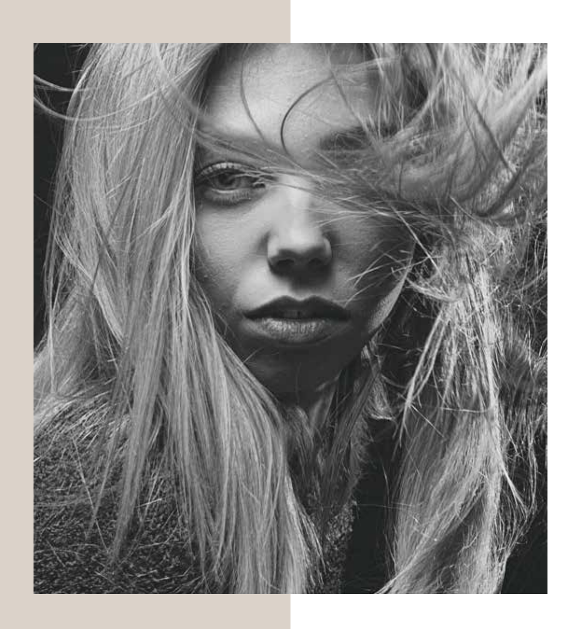
Nomen suffer pair loss too ... but there are real solutions